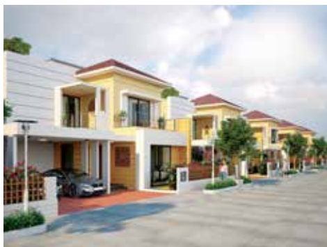
Pride Crosswinds Villas