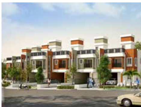
Pride Vatika Row House