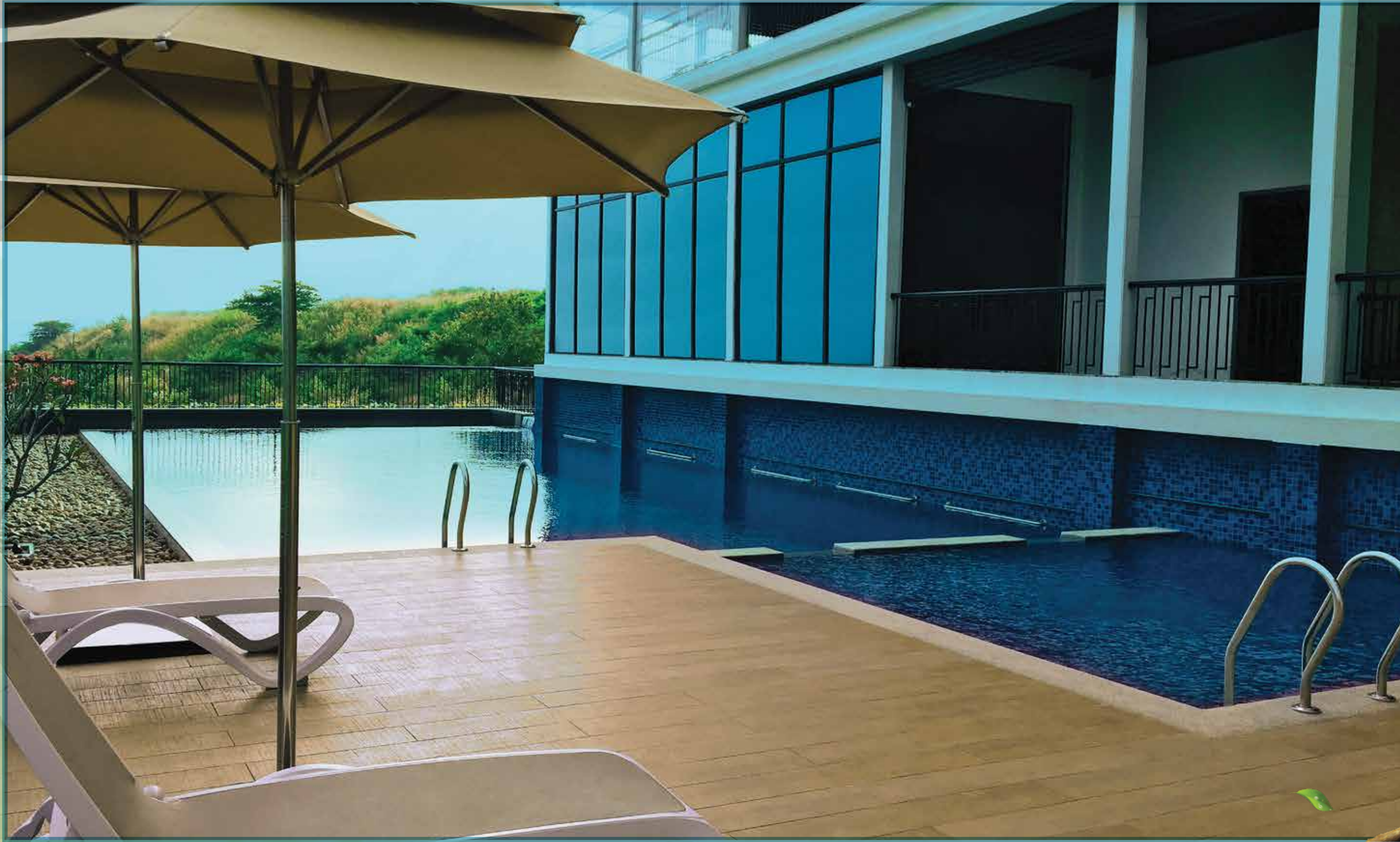
SHOT AT LOCATION